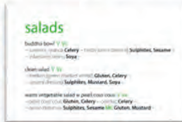
Menus or Tariffs