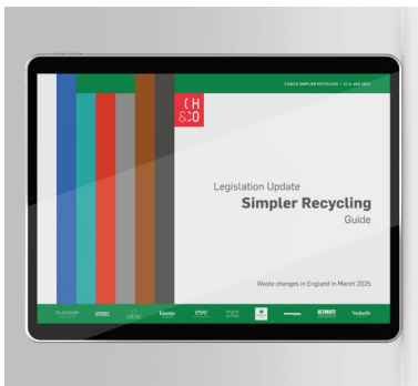
Simpler Recycling guide