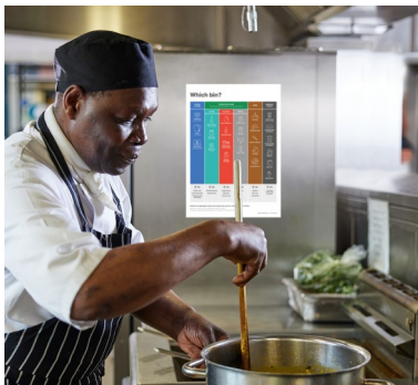
Simpler Recycling 'Which bin?' BOH poster