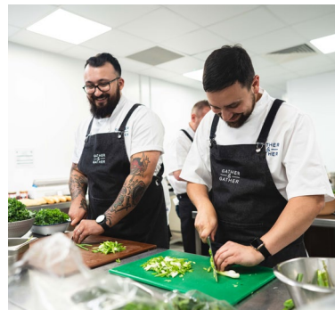
Simpler Recycling team training