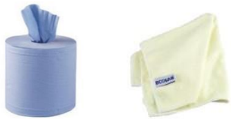
Use your cleaning tools

Please reference the relevant Safety Data Sheets, risk assessment and safe system at work documents.