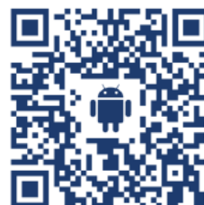
ANDROID USERS SCAN HERE

Download the Origami Mobile App on your mobile by scanning the applicable QR code. Once you open the App enter Compass as the Account Name, click 'Continue', select 'Use a passcode instead' and enter the 6-digit passcode for your sector. (This can be found on the on the Origami App Sector Access Codes document or by contacting hse@compass-group.co.uk )