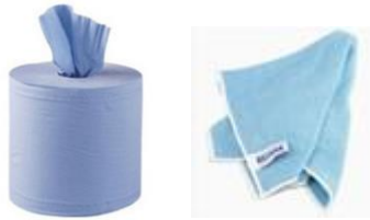
Use your cleaning tools

Please reference the relevant Safety Data Sheets, risk assessment and safe system at work documents.