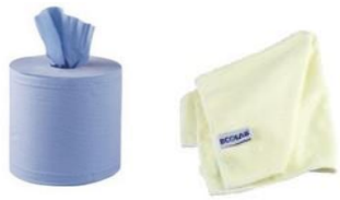
Use your cleaning tools

Please reference the relevant Safety Data Sheets, risk assessment and safe system at work documents.