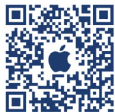
APPLE USERS SCAN HERE