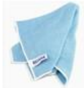
Use your cleaning tools – Cloth

Please reference the relevant Safety Data Sheets, risk assessment and safe system at work documents.