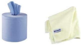
Use your cleaning tools

Please reference the relevant Safety Data Sheets, risk assessment and safe system at work documents.