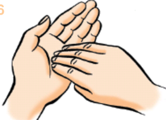
Press fingertips into the palm of each hand