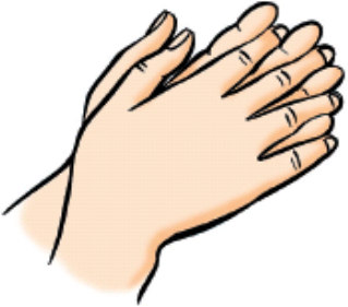
Make sure product gets in between the fingers